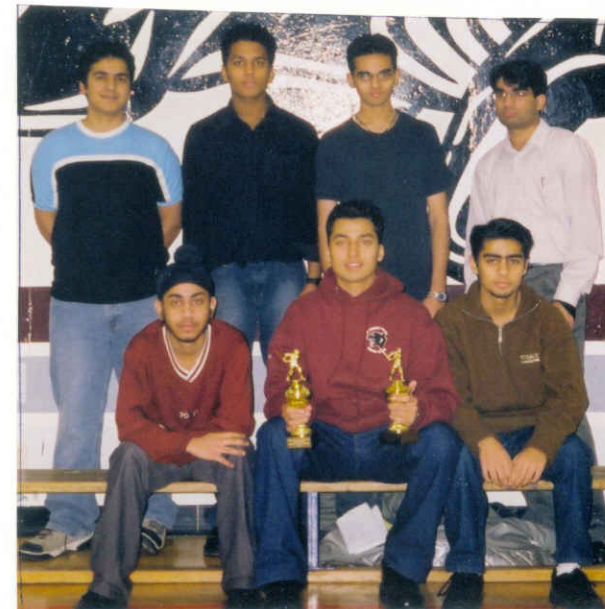
Schools Indoor Cricket High School Champions – 2002 J. Percy Page High School