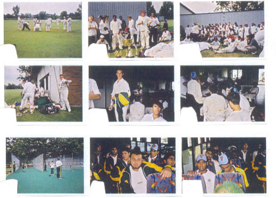
'B' Division Cricket Champions Edmonton & District Cricket League 2002. Juniors/Colts ASCA ~Our First Win Since 1985~