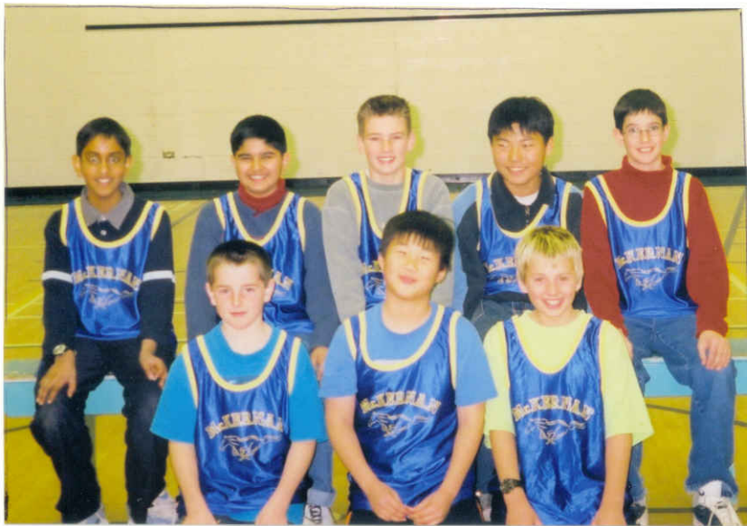
Schools Indoor Cricket U-11 Runners Up – 2002 McKernan School