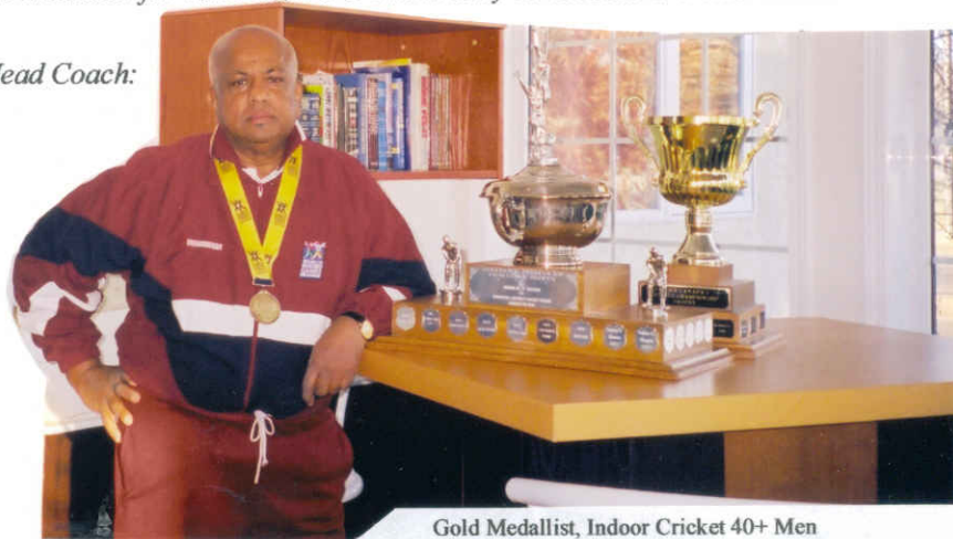
Gold Medallist, Indoor Cricket 40+ Men World Master's Games, Melbourne Australia 2002