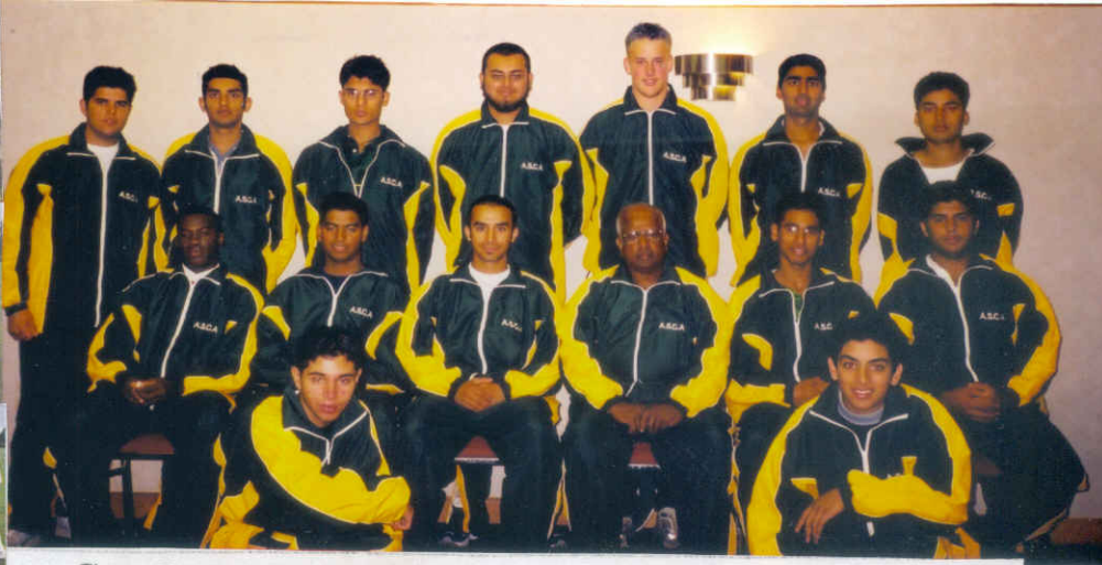
Canada Cup 2002 National Tournament U-18 Team Alberta