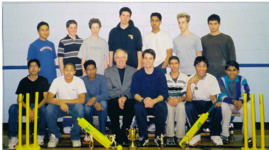
Schools Indoor Cricket U-14 Champions – 2002 Rosslyn School