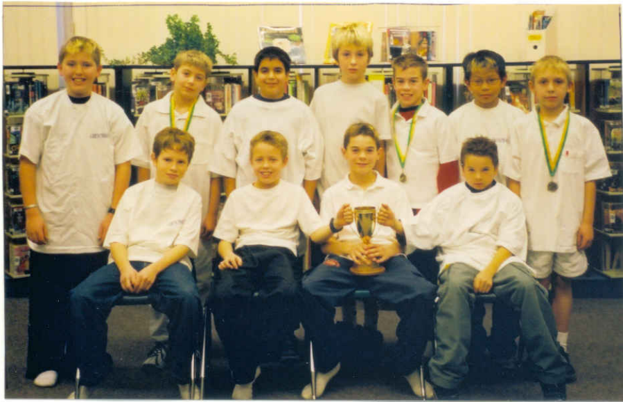
Schools Indoor Cricket U-11 Champions – 2002 Crestwood School