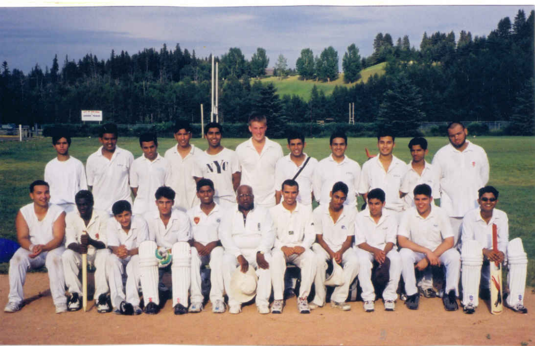
Live-in-Camp Red Deer 2002.